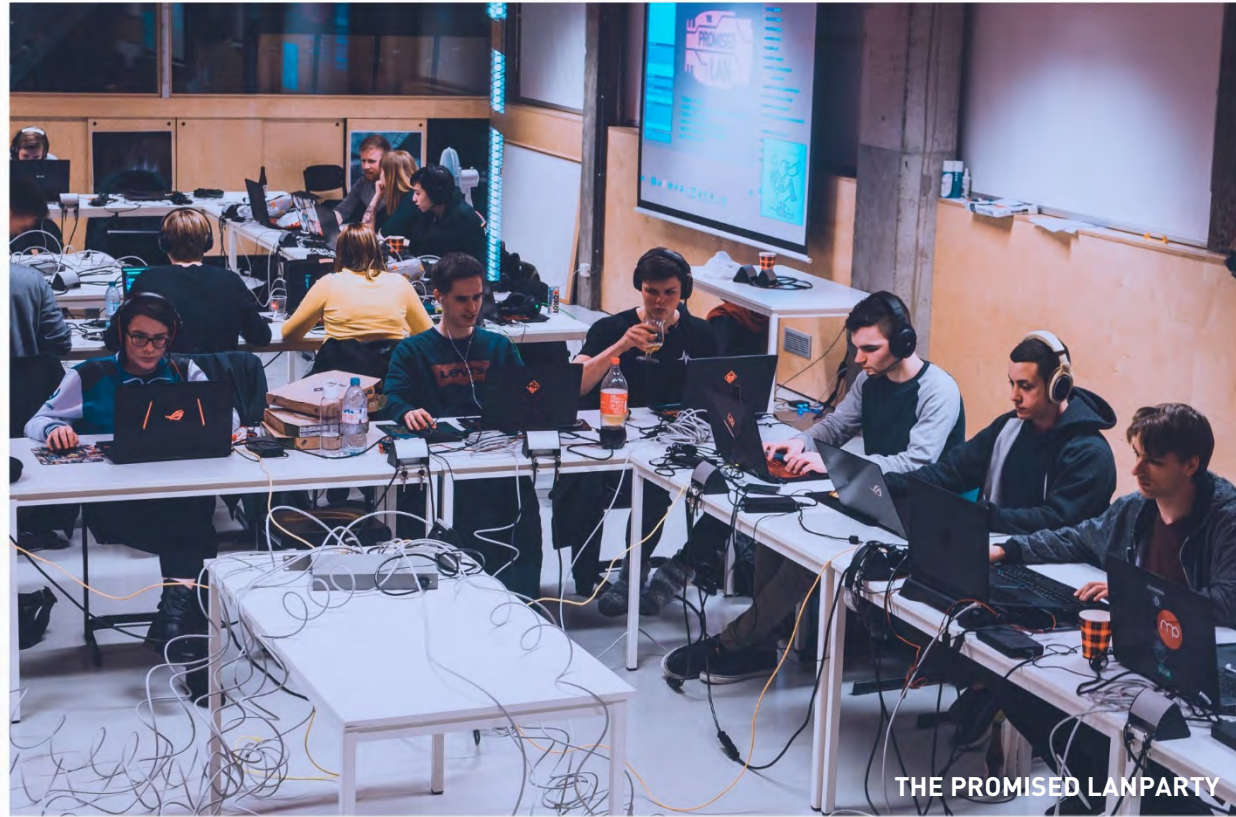
THE PROMISED LANPARTY