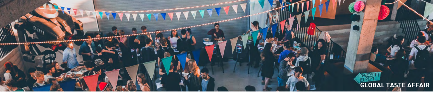
WEST EUROPE GLOBAL TASTE AFFAIR